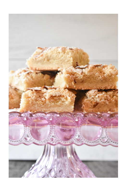
Almond Shortbread Bars $35