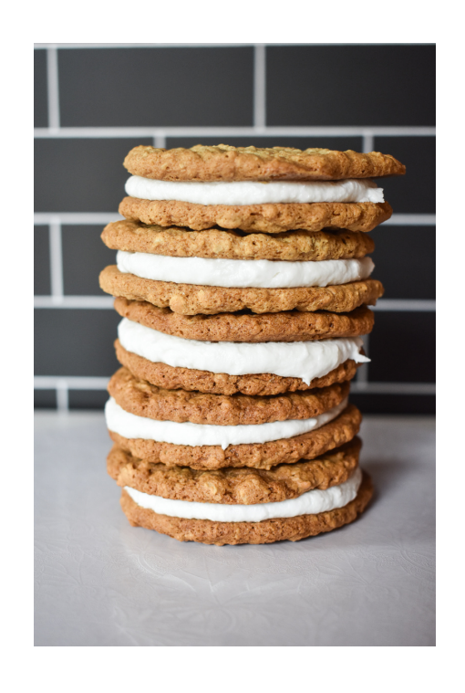
Oatmeal Cream Pies $35/dz $24/6