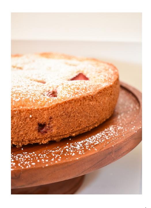
Strawberry Cake $30