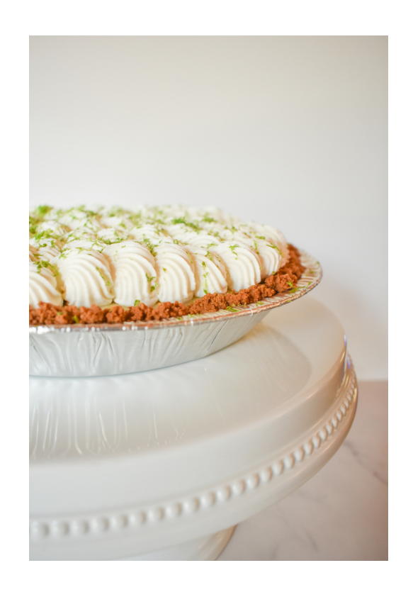
Key Lime Pie $35