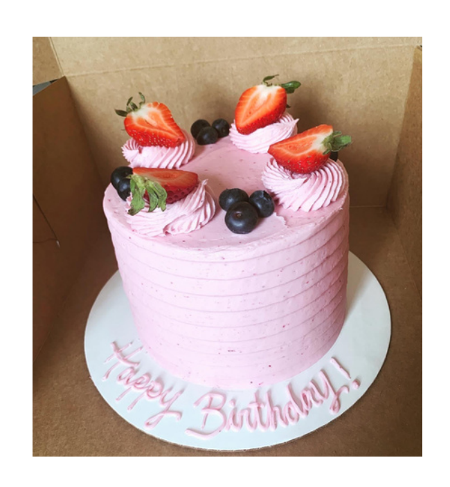
Mixed berry cake $50 6"